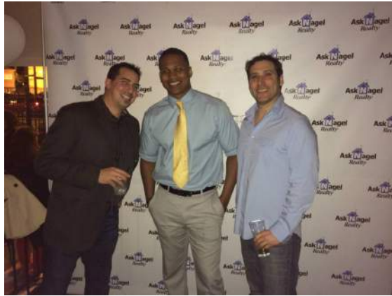
(Click on photo to view event details in Facebook)