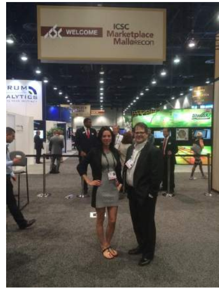
(Click on photo to view event details in Facebook)